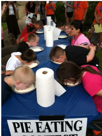
Pie Eating Contest for the kids