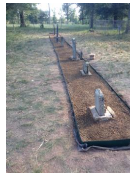
Richard Williams Cemetery