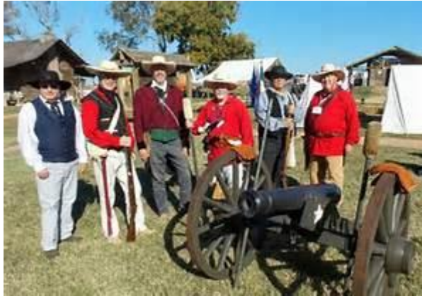
Sons of the Texas Republic at Texian Heritage Festival