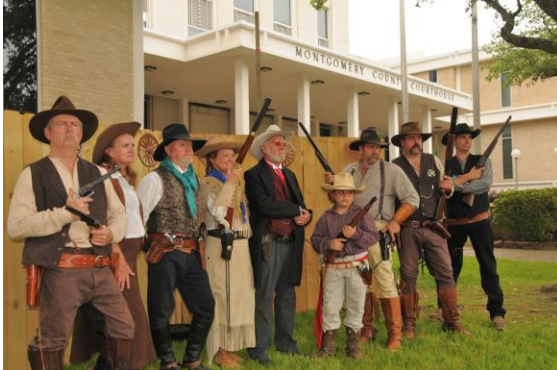
Wolf Creek Pistoreros