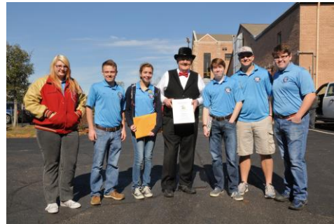
Youth Advisory Board kids serving at Road Rally