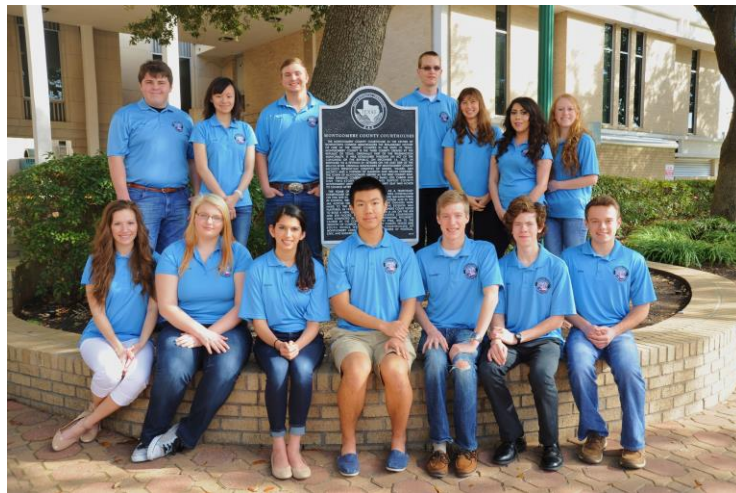
2014-2015 Youth Advisory Board